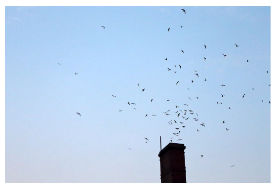
Hundreds of Swifts are expected to roost in the chimney of the Village Hall in West Dundee on Saturday, Sept. 10.

You do not need to be a KCA member to attend. Binoculars are optional because Swifts are visible with the naked eye as they enter the chimney.